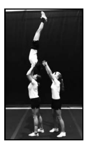
ALL ARE LEGAL

3. The picture on the bottom of Page 51 is Illegal.